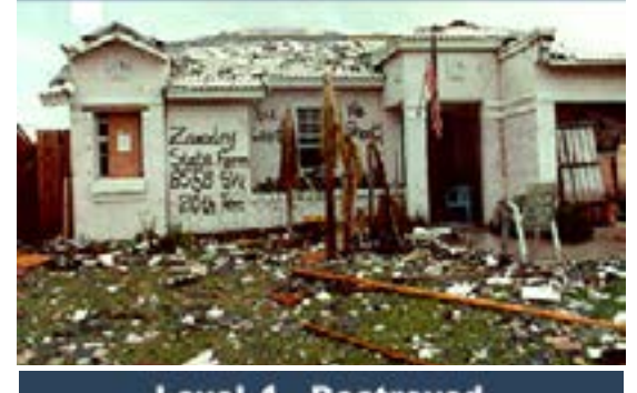
Level 4 - Destroyed