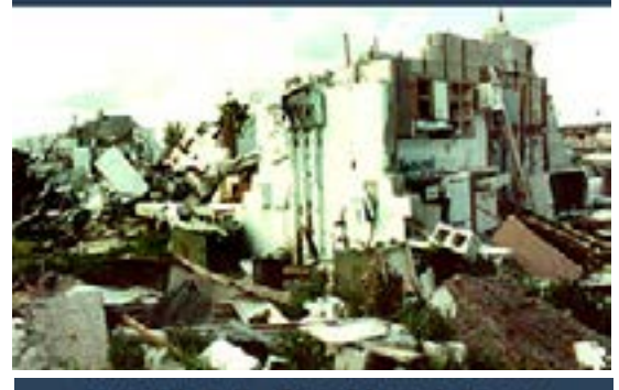
Level 5 or 6 - Flood Level, if any